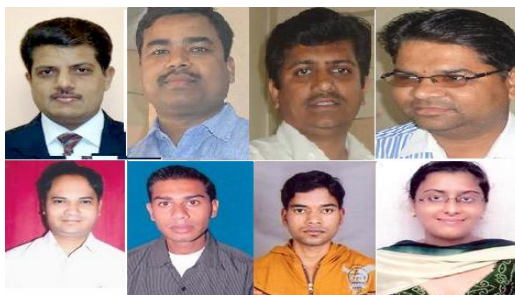
Team: IIM Indore Learning Centre