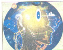
MEETING OF MINDS

Indore: A three-day international conference on knowledge and wisdom through shared learning started on Thursday at the Indian Institute of Management (IIM-I), Indore. The conference is being organized to bring together and provide a platform to library and information science professionals, academicians and educationists to present papers, discuss, ex-